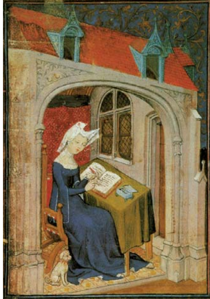
Christine de Pizan

For more information on the Department of German, please consult our website: