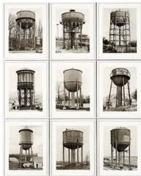
Bernd and Hiller Becher, Water Towers. , 1988.

Students should make every effort to meet the deadlines for drafts set by the departmental representative, keeping in mind that the most successful papers are those for which advisers are able to give feedback.