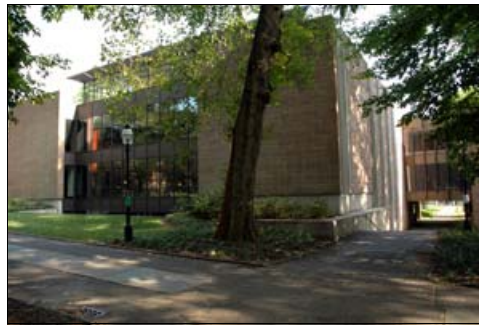
Marquand Library McCormick Hall

This non-circulating library is one of the oldest and finest art libraries in America. The holdings cover the history of art and architecture, from prehistoric rock painting to contemporary art and photography. Archaeology collections range from classical, medieval and Byzantine, to Islamic, pre-Columbian, and East Asian archaeology. Materials are collected in many languages (including English, German, French, Italian, Modern Greek, Russian, Chinese, and Japanese) and in all formats -- books, journals, microforms, dealers' catalogs, electronic resources, CDs and videos. The library houses its own rare book collection. At present the collection includes more than 750 current journals; 230,000 monographs and bound periodicals. Information at: http://marquand.princeton.edu or call 258-3783.