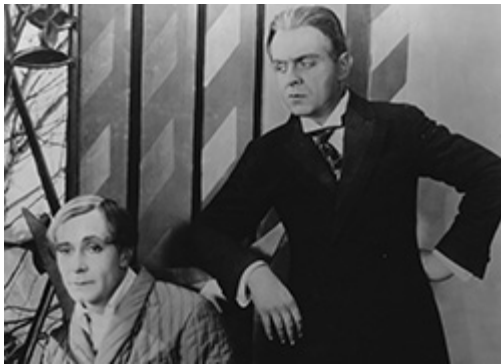
Dr. Mabuse, the Gambler ( Dr. Mabuse, der Spieler )