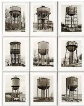
Bernd and Hiller Becher, Water Towers , 1988

Students should make every effort to meet the deadlines for drafts set by the Director of Undergraduate Studies, keeping in mind that the most successful papers are those for which advisers are able to give feedback.