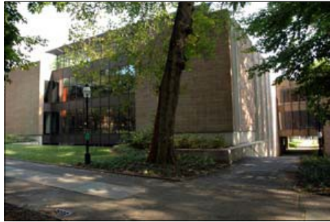
Marquand Library (McCormick Hall)

architecture, from prehistoric rock painting to contemporary art and photography. Archaeology collections range from classical, medieval and Byzantine to Islamic, pre- Columbian, and East Asian archaeology. Materials are collected in many languages (including English, German, French, Italian, Modern Greek, Russian, Chinese, and Japanese) and in all formats -- books, journals, microforms, dealers' catalogs, electronic resources, CDs and videos. The library houses its own rare book collection. At present the collection includes more than 750 current journals; 230,000 monographs and bound periodicals. Information at: library.princeton.edu/marquand or call 258- 3783.