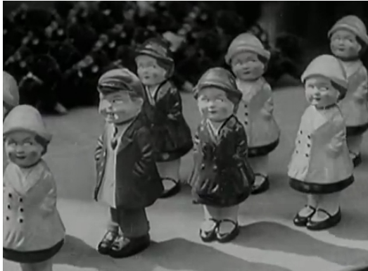
Still from " Berlin: Die Sinfonie der Großstadt " [Berlin - Symphony of the Metropolis] directed by Walter Ruttmann (1927)