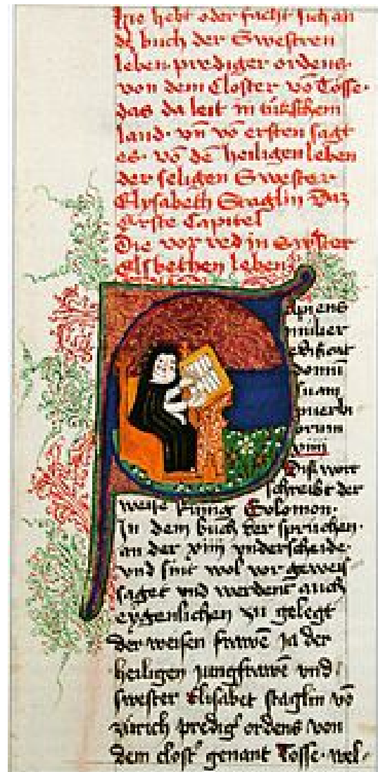
Elsbeth Stagel composing the Sisterbook for the Töss Cloister. Stadtbibliothek Nürnberg, MS Cent. V 10a, fol. 3r.