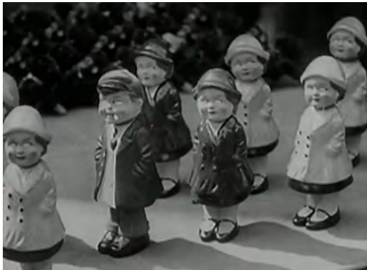
Still from " Berlin: Die Sinfonie der Großstadt " [Berlin - Symphony of the Metropolis] directed by Walter Ruttmann (1927)