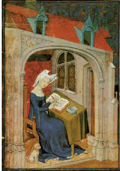
Christine de Pisan in her study (detail) The Queen's Manuscript, c. 1410–1414 f. 4r (Harley MS 4431, British Library)

For more information on the Department of German as well as up-to-date announcements on departmental events, lectures, and conferences, please consult our website: