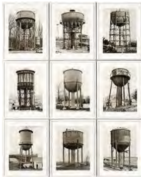
Bernd and Hiller Becher, Water Towers , 1988

Students should make every effort to meet the deadlines for drafts set by the Director of Undergraduate Studies, keeping in mind that the most successful papers are those for which advisers are able to give feedback.