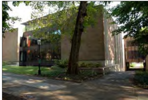
Marquand Library (McCormick Hall)

This non-circulating library located in McCormick Hall is one of the oldest and finest art libraries in America. The holdings cover the history of art and architecture, from prehistoric rock painting to contemporary art and photography. Archaeology collections range from classical, medieval and Byzantine to Islamic, pre- Columbian, and East Asian archaeology. Materials are collected in many languages (including English, German, French, Italian, Modern Greek, Russian, Chinese, and Japanese) and in all formats -- books, journals, microforms, dealers' catalogs, electronic resources, CDs and videos. The library houses its own rare book collection. At present the collection includes more than 750 current journals; 230,000 monographs and bound periodicals. Information at: library.princeton.edu/marquand or call 258- 3783.