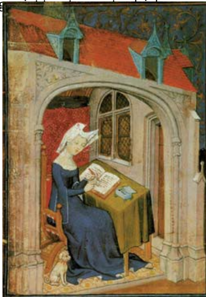
Christine de Pizan

It takes, on average, three tries on the market to get an academic job. You should not be discouraged if you do not get something (or something perfect) your first time out. If there is no offer from the first round of searches, keep looking at the subsequent job lists. A one-year position is better than no position and is often a launching