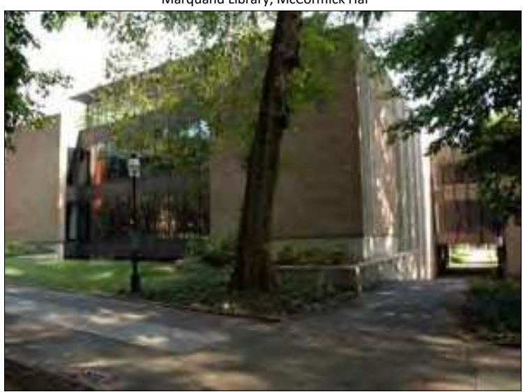
Marquand Library, McCormick Hal

NOTE: Until Fall 2024, McCormick Hall will be undergoing renovation for construction of the new Princeton University Art Museum. Marquand Library's physical collections are currently available only by advanced request via the library catalog for consultation in two temporary reading rooms in Firestone Library, C Floor.